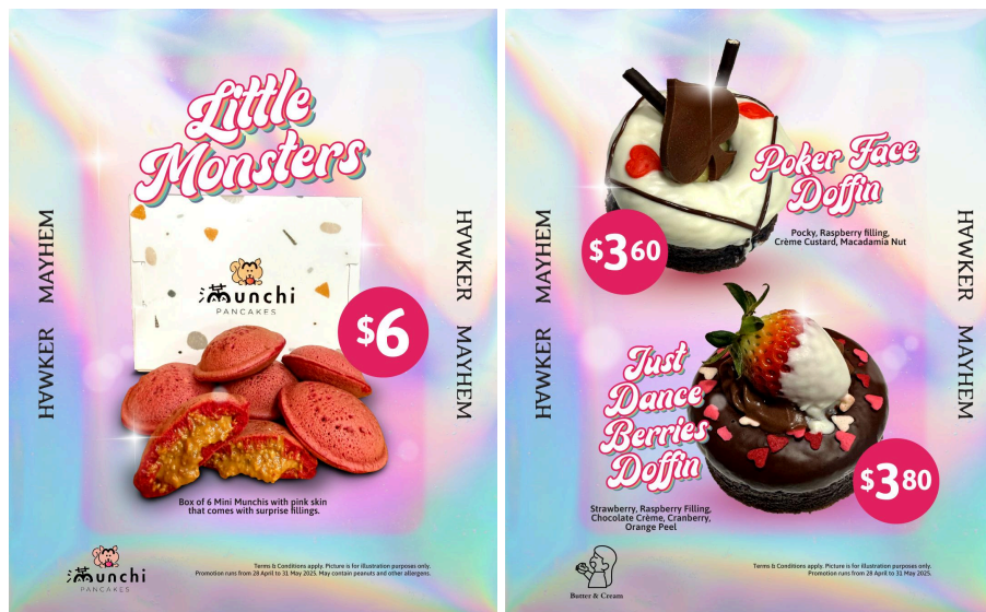
Left: Munchi Pancakes' 'Little Monsters', Right: Butter and Cream's Poker Face Doffin and Just Dance Berries Doffin

No need to worry about wolves in disguise at Lau Pa Sat. Instead, eat your heart out with a slew of fantastico tenant promotions and Gaga-themed creations inspired by Mother Monster herself: