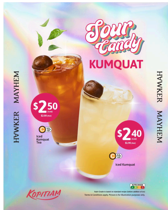
Sour Candy Kamquat

Then, head to Butter and Cream , for their unique donut and muffin hybrid, Doffins. To welcome the coming of Lady Gaga, they have come up with the Poker Face Doffin ($3.60), filled with Pocky (Poker Faced, and Pocky, get it?), raspberry, smooth crème custard, and macadamia nut; as well as the Just Dance Berries Doffin ($3.80), which will get your feet tapping with strawberry, raspberry, chocolate crème, tart cranberry, and vibrant orange peel. These special Poker Face and Just Dance Berries Doffins are available for a limited time only, from April 28th to May 31st.